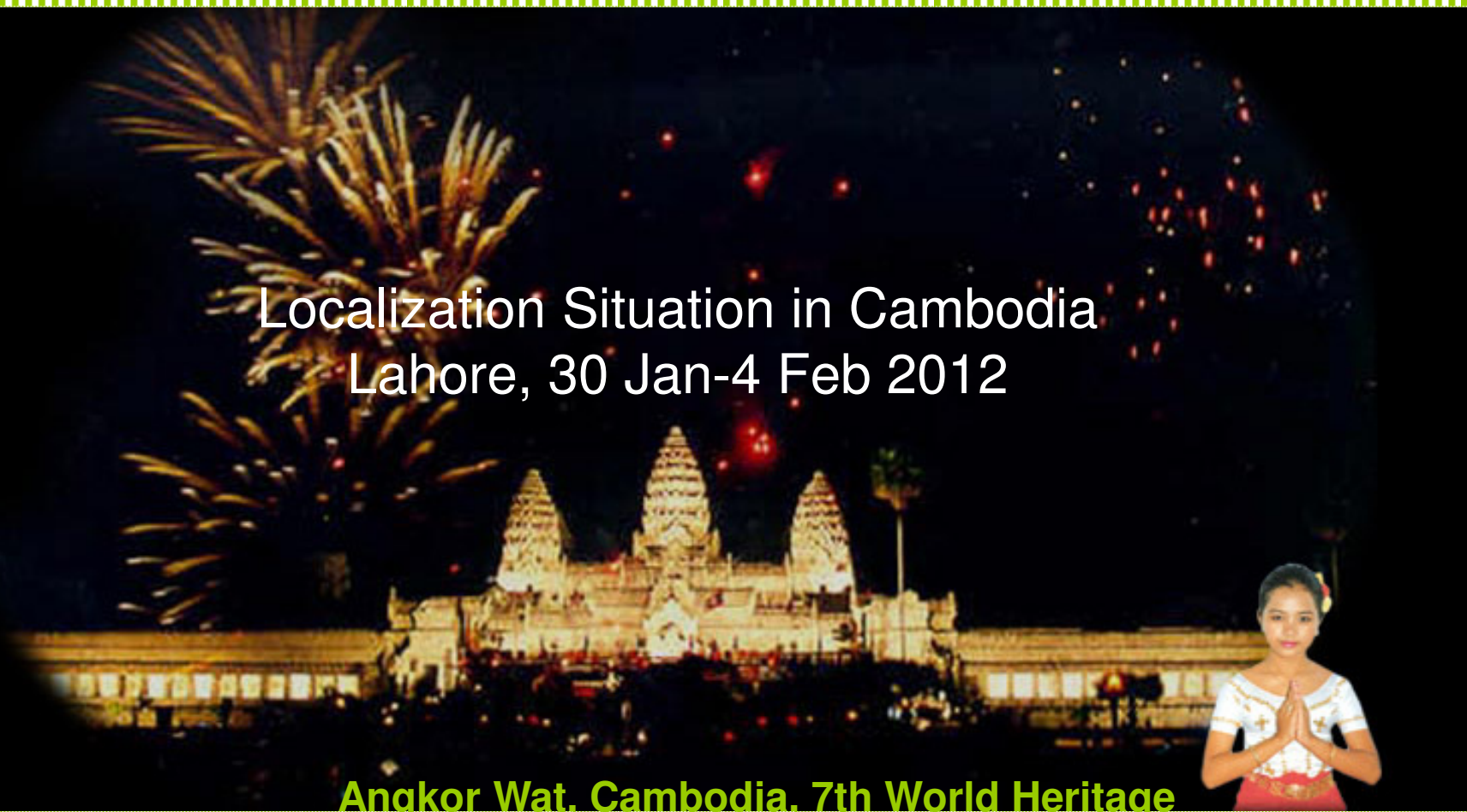
Angkor Wat, Cambodia, 7th World Heritage

National ICT Development Authority (NiDA)