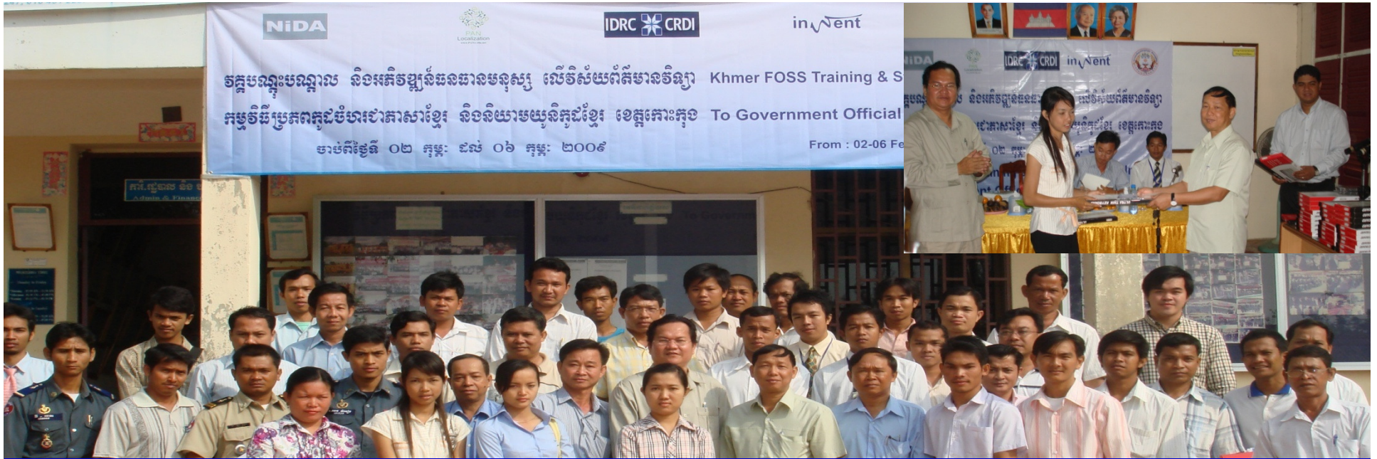
HAND OVER TRAINING MATERIAL, KEYBOARD, TEXT BOOK AND ACTIVITIES 02-06 FEBRUARY 2009